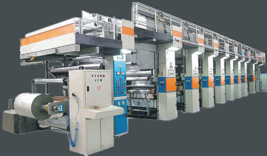
ROTOGRAVURE PRINTING MACHINE

ISO 9001:2008 Certification followed by Strict quality control checks that start from raw material and extend to each process of production. Our well qualified QC staff ensures regular checks for Clarity, Printing, Tensile, Dart and Sealing strengths of our products as per well laid out procedure. We ensure high quality end products that have helped us to earn our reputation amongst our esteemed customers some of who are prominent players in their own fields.