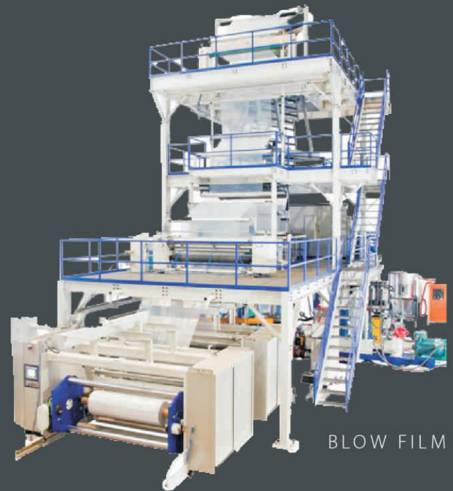
BLOW FILM PLANT